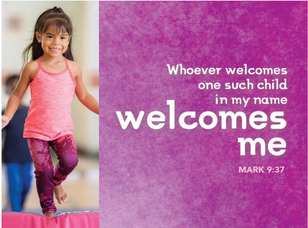
Image: Child in gymnastics class. © iStock/FatCamera. Used by permission.

September 19, 2021 St. Mark's Lutheran Church, ELCA