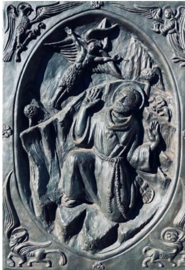
Relief from The Cathedral Basilica of St. Francis of Assisi, Santa Fe, NM